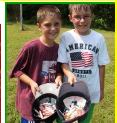
Caps full of candy!